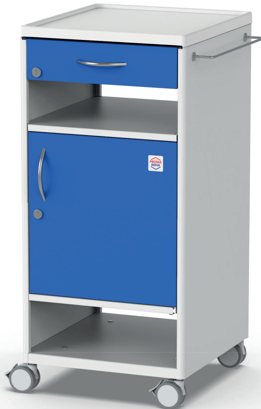
NS-20 Bedside tables