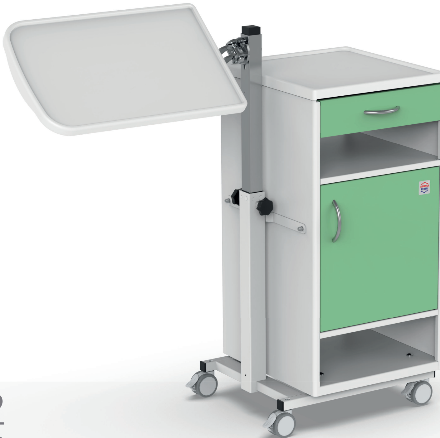
NS-22 Bedside tables